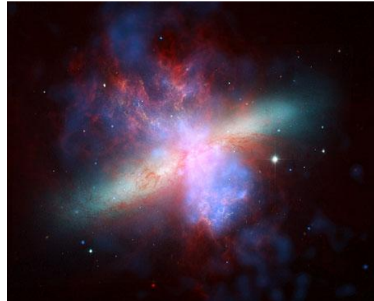
This image of M82 combining x-ray, visible, and infrared light from three observatories is typical example of the kind of visual resources with rich contextual information ideal for AVM tagging.

The astronomical education and public outreach (EPO) community plays a vital role in conveying the results of scientific research to the general public. A key product of EPO development is a variety of non-scientific public image resources; both derived from scientific observations and created as artistic visualizations of scientific results. This refers to general image formats such as JPEG, TIFF, PNG, GIF, not scientific FITS datasets. Such resources are currently scattered across the internet in a variety of galleries and archives, but are not searchable in any coherent or unified way.