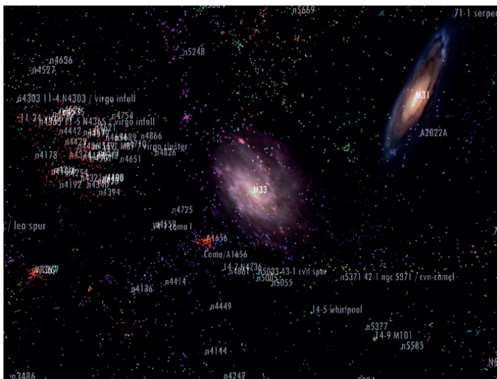
Figure 2. Placing EPO images in the right context within Digital Universe models in different environments such as the planetarium domes or on the desktop, may well be one the hottest issues in EPO over the next decade. Image from the Uniview application, property of Sciss AB Sweden, and the Digital Universe database, property of the American Museum of Natural History

Today's search engines work by searching and indexing the textual information in html text-pages on the web. Existing audiovisual search tools, such as Google Images, can only search textual information that is placed around embedded images on a web page. This information consists largely of random pieces of text that often have little to do with the actual images and furthermore only images embedded in html pages can be searched. All audiovisual content in image or video archives, or databases, cannot be searched in this way and thus excluding a large majority of existing audiovisual content by far. In addition, real archives are the preferred storage method for the highest quality content, i.e. the content closest to the scientific and cultural sources.